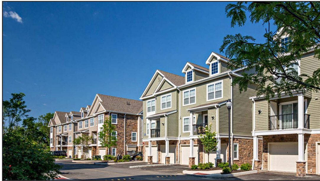
Avalon Green - Elmsford, NY

Rent control is coming to the Hudson Valley apartment market. Socialists in the New York state legislature are pushing to pass statewide rent control later this year in the form of the Good Cause Eviction bill. The bill would make it near impossible for building owners to evict tenants for almost any reason and add caps to rent increases for market rate apartments. There is a long history of the effects of rent control on the multifamily housing market; expect the number of apartments for rent to contract, new market apartment construction to vanish, and rents to rise. The demand from tenants is there, rent control will significantly reduce competition, this is a supply side issue. The Real Estate Board of New York and other sources estimate the city of New York will need an additional 500,000+ new homes by 2033. This will never happen in the current environment; the unmet demand will look elsewhere including the Hudson Valley. Freezing rents with unmet demand to protect existing tenants is going to significantly reduce the supply of new apartments over time. Builders will not build in rent control